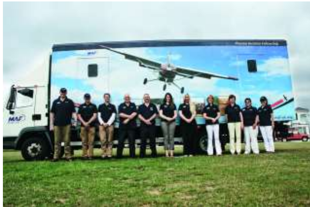
Using your skills