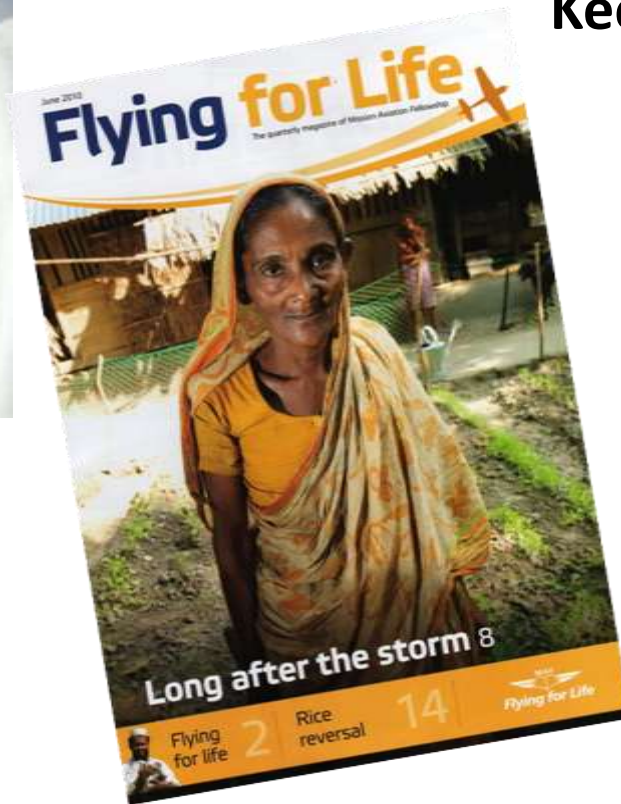
Keeping in touch